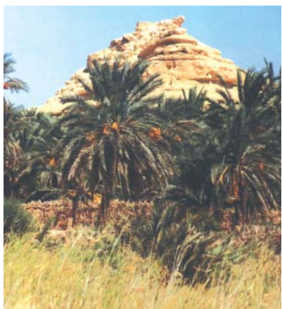
Left: Tafrata, province of Taza, Morocco. Pistachio tree, a species that has almost disappeared in the area of Tafrata because of degradation, is protected from animals grazing by the planting of Jujube fruit trees around it